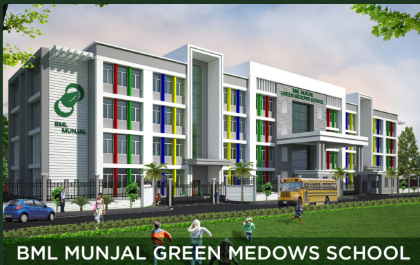
BML MUNJAL GREEN MEDOWS SCHOOL